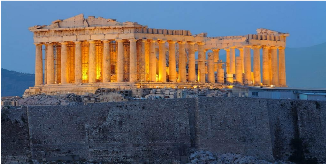
Parthenon - Athens

After breakfast check out. Today we shall enjoy a morning sightseeing tour of Athens, including a visit to the Acropolis & its Museum, as well as a panoramic tour of the highlights of the city. At the end of the tour you will be transferred to Piraeus port for cruise embarkation. (B)