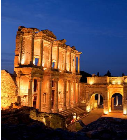
Library of Celsus

Few places offer such a rich combination of history and scenic beauty. In Ephesus, one of the greatest outdoor museums in the world, you'll explore legendary sites steeped in history. We will explore the ancient city with its Library of Celsus, the Temple of Hadrian, and the great Theater.