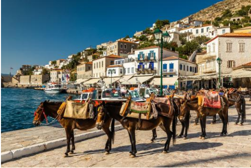
Mules at the Hydra

Donkeys are the main way to transport things here. These surefooted beasts of burden, laden with everything from sandbags and bathtubs to bottled water, climb stepped lanes. On Hydra, a traffic jam is three donkeys and a fisherman. We will have from noon to 10pm to explore this beautiful Greek island.