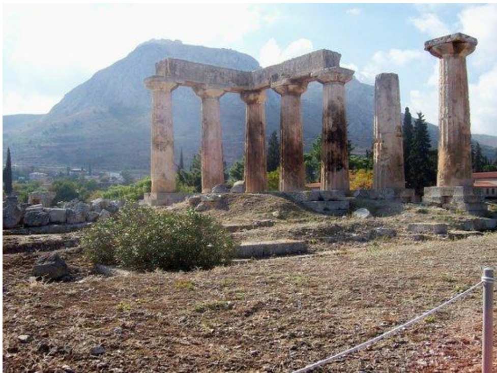
Ancient ruins of Corinth

Today we will explore the ruins of ancient Corinth and see the Corinth Canal on this tour. Travelling by air-conditioned coach, enjoy a scenic drive from Athens to Corinth along the shores of the Saronic Gulf. Pass beautiful beaches and view the spectacularly narrow Corinth Canal built to link the Saronic and Corinth Gulfs during the 1890s. Stroll around the relics of Corinth, once an influential ancient Greek and Roman City, and then visit the seaside town of Kehreai before your return to Athens. Dinner and overnight at hotel. (B,D)